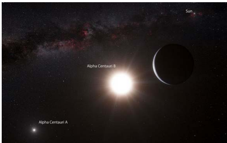
Artist's impression of the planet around Alpha Centauri B.

Want to stay on top of all the space news? Follow @universetoday on Twitter